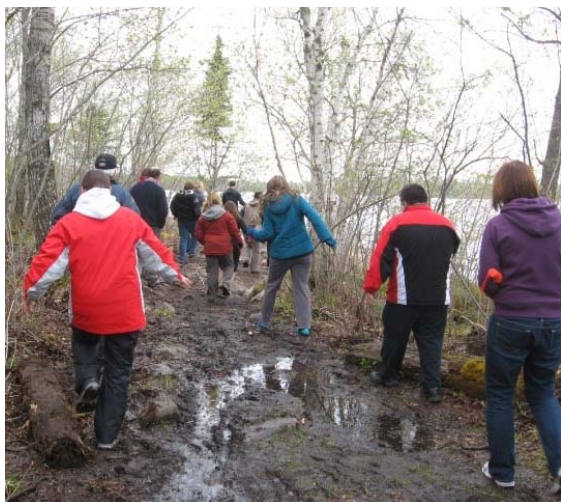
A portion of the Rabbit Lake Trail System before the students got to work.