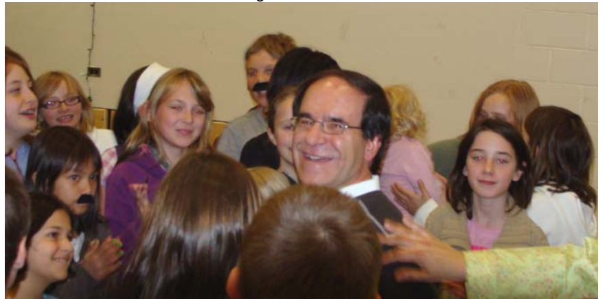
SMB Students coming at beloved principal like a tsunami following the unveiling of the shaved moustache.