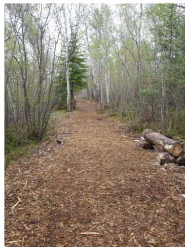
What the trail looked like after the students had completed - dry and inviting.